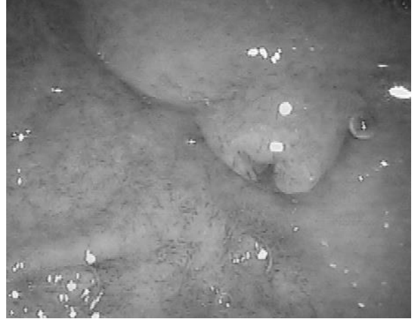
Fig.4. Endoscopic image with specular reflections

Fig.4 shows an endoscopic image which contains specular reflections. We can see isolated and grouped reflection areas.