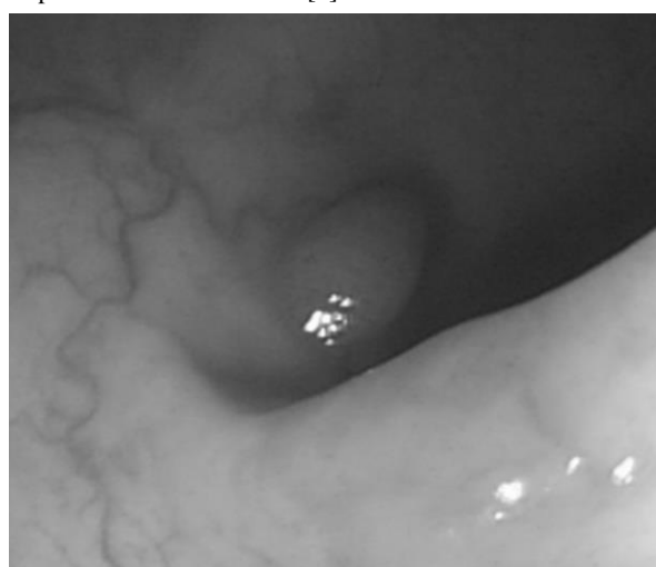
Fig.1 Colonoscopic image showing colonic polyp which has specular reflections on its surface

may affect the surface texture and may negatively impact on robust detection [5].