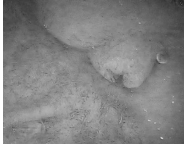
Fig.5. Endoscopic image where specular reflection areas are concealed with proposed method.

Fig. 5 shows the image after applying the proposed method. We can see that almost all the reflections have been detected and concealed. Only small areas in left corner which have low brightness level have not been detected.