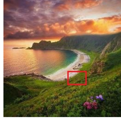
Figure 1. Example image

As an example shift to vector (1,1) of nature image pic. 1 will be considered.